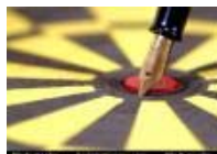
Your Message on Target !!

I adapt my writing style to the message you wish to convey. Your unique message will be brought to life so that you will realize the results you desire, allowing you to stand out from the competition..